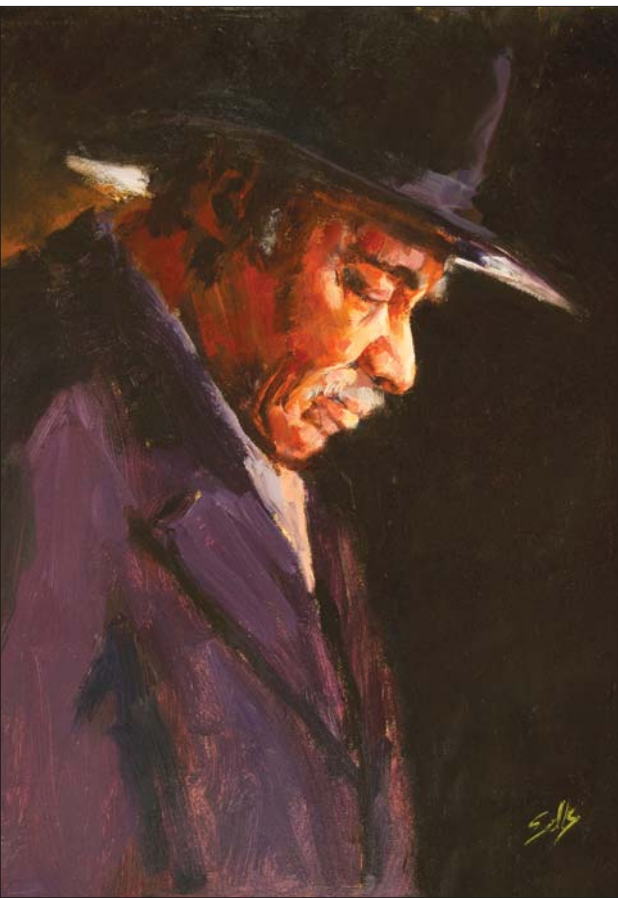
"Purple Coat," by Duane Eells, oil on canvas